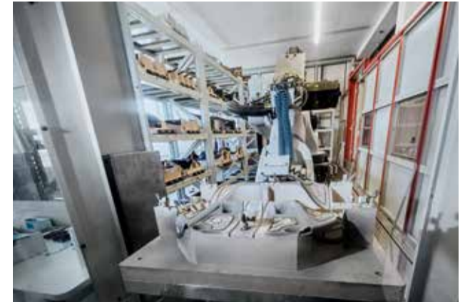
Loading/unloading (complete with workpiece clamping device and workpiece) of a loaded workpiece pallet into or out of the setup station