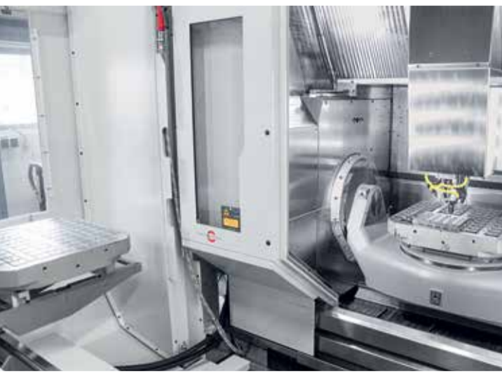
Working range of the compact 5-axis C 42 UP machining centre with the NC swivelling rotary table 800 x 630 mm for holding differently stocked pallets. On the left there is a pallet stored in the magazine pocket

The Brink Group from the Netherlands – a specialist in die cast tools and production automation in thin-walled packaging for foodstuffs, cosmetics and chemical products, with a focus on plastic packaging with wall thicknesses from 0.25 to 2 mm and FFS (Form Fill Seal) turnkey solutions – has developed into one of the world's leading companies in the field in the last 40 years. As mentioned previously, the primary focus is on the development, design, manufacture and servicing of single, multiple and multi-stage tool systems for mass production of thin-walled packaging in die cast technology as well as the turnkey solutions. As the size of the packaging extends from 20 ml to 30 l, the corresponding multi-tools may be up to 1 m 3 and more in volume. The base plates and components for the die cast tools are just as large accordingly. The more so as customer requirements for cycle times/output, optimal material efficiency, reproducible quality and maximum runtimes in multi-shift operation can only be met by using multiple tool systems plus fully automatic parts handling.