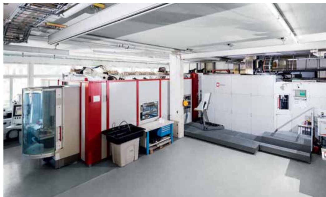
Right, the 5 axis CNC high-performance C 50 U machining centre, left of which is the connected robot system RS 3