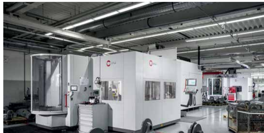
The second Hermle C 60 U MT dynamic with pallet changer PW 3000