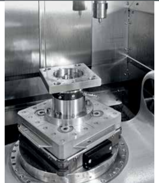
The 5-axis swivelling rotary table of the C 22 U

Most of the five-axis machining at the factory in Huddersfield, UK, relates to prismatic components, where access to multiple sides of the workpiece with a high degree of accuracy is the primary requirement. It ensures that the tool can machine the component more efficiently in fewer operations, without the need for costly fixturing.