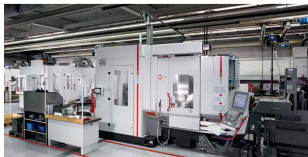
The Hermle C 12 U with pallet changer PW 150 is our training machine of choice in metal-cutting manufacturing