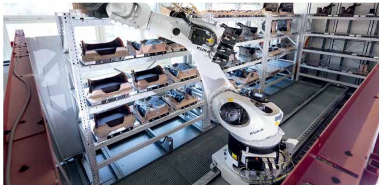
Robot system RS 3 with the linear additional axis for a total of 43 workpiece pallets

Following a relatively short training period, the workers and the supervisor of CNC manufacturing at Connova AG, Philipp Folghera, were using the flexible manufacturing system, optionally, in a manned one-shift operation, or unmanned in a second shift, as well as in unmanned weekend manufacturing. Jon Andri Jörg said: "The typical manufacturing batch for us lies at between 1 and 20 pieces but sometimes it goes up as high as 150. The flexible manufacturing system of Hermle contains between 30 and 40 extremely different tasks or extremely different workpieces which we process fully automatically, for example by all around engraving or milling of holes and gaps. The concept of the machining centre's C 50 U with 3 axes in the tool and two axes in the workpiece is ideal for composite machining, because the contours or milling tools, which depending on the form are often very long and jut out, always remain at a 90° angle to the laminated surface due to the 5 axis settings. This avoids delamination and fraying from the very beginning and we can produce quality workpiece for workpiece."