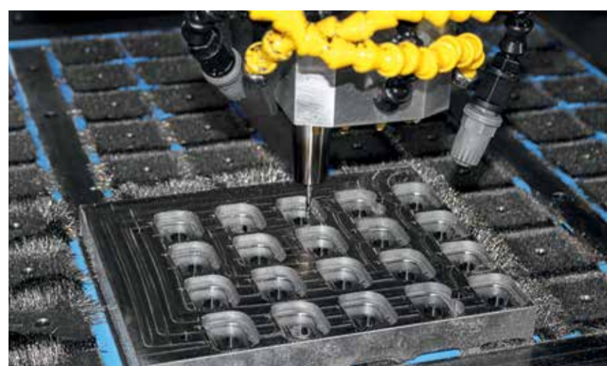
A change-pallet with assembled magnetic clamping plate and the multi-tool insert (20x) of a die cast tool system in finish machining